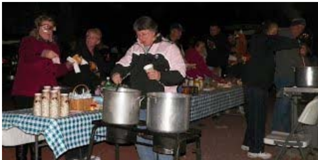
Hot Dogs, Hamburgers, Hot Cocoa and Cider