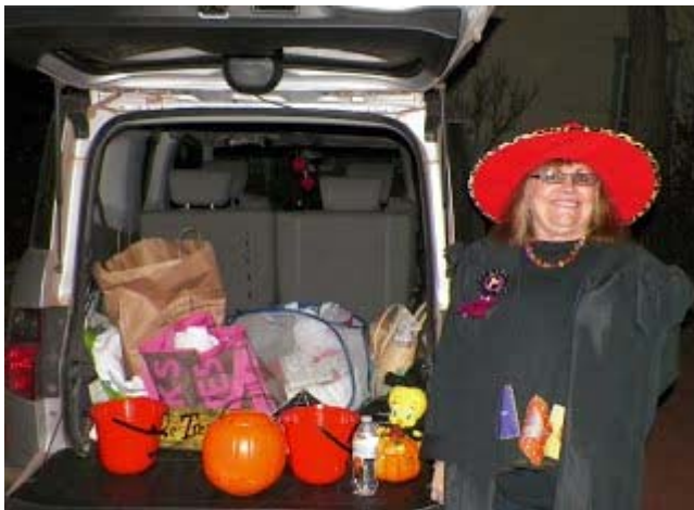
Decorated Trunks and passing out candy