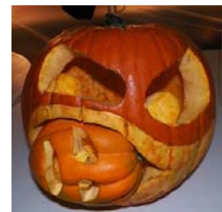
Pumpkin Carving Contest