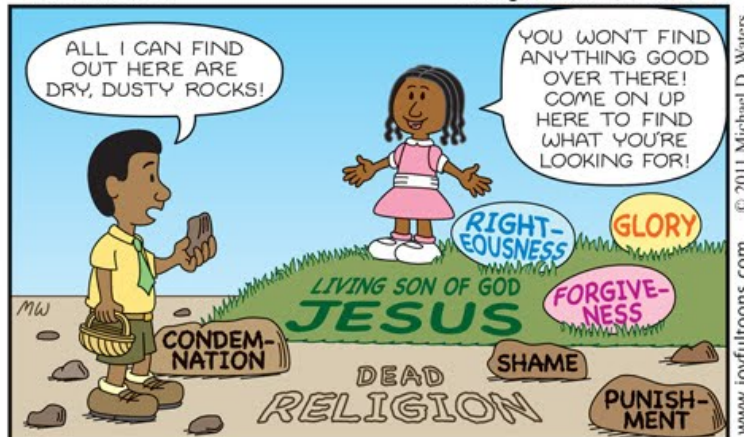
In their fright the women bowed down with their faces to the ground, but the men said to them, "Why do you look for the living among the dead?" — LUKE 24:5 NIV